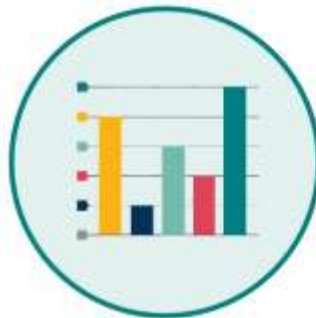
Student Action Plan